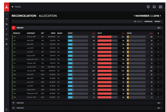
End-Of-Day is a Piece of Cake

To automate your end-of-day with the world's easiest trading software, get in touch online or at +1 832 464 4037.